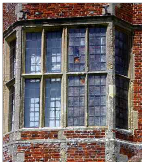
Fig. 6. The ground floor window partially bricked up on the inside. The left window is functional, but with blinds.