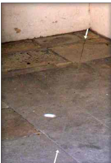
Fig. 5. The best preserved part of the line with the elongated spot of sunlight, photographed at local solar noon, showing the large error in time.

The answer to the distorted spot is due to the glass being far from flat. Indeed, the part of the spot of light on the floor that is nearest to ‘correct time’ is the weakest trailing edge. Given the faults in the window and aperture, it is interesting to speculate how the line was laid out in the first place. The line itself extends across part of the loggia, although somewhat worn where it is more exposed. It should also extend up part of the pillar but there is no clear evidence of