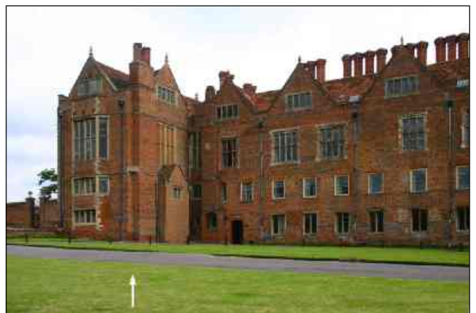
Fig. 10. The vertical west decliner is about 6m above ground level set across the re-entrant corner. Although 85cm wide, the dial appears relatively insignificant in this view.

Nearby is a horizontal dial and it is tempting to speculate that allegiance was transferred to the humble dial, probably set up to take over the task of time determination. This dial set on the balustrade quite near to the meridian line, as in Fig. 8. There is no maker's name or date, but the quality of the engraving is good and it could be as early as late 17 th century. The setting on the balustrade is quite purposeful and in addition to being close to the meridian line, it is near to one of the principal rooms of the house. The specific location is reinforced by the fact that its overall time telling is severely compromised by being rather close to the wall in