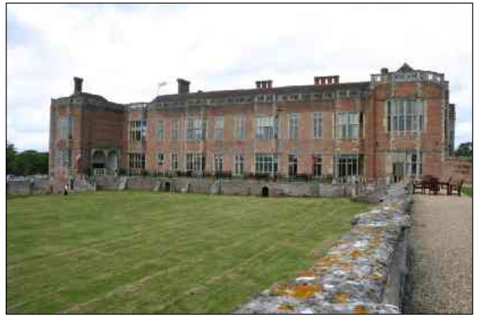
Fig. 2. The south west facing front and terrace. The meridian line is in the far loggia and the aperture is in the upper part of the ground floor window.

offices. The house is a good example of Jacobean architecture and, apart from a fire some time in the 1640s that damaged part of the south west side of the building, is largely unchanged. The house is now recorded as a Grade I listed building. Architecturally, the house is similar to the more well-known Temple Newsam House in West Yorkshire.