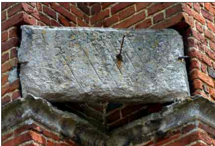
Fig 11. A close up of the vertical dial with the rusted horizontal rod gnomon.

The other sundial of possibly greater interest is a very early vertical west decliner, which is partly resting on the stone string line course of the north east wing, see Figs 10 and 11. The numerals are legible, as are part of the initials and a date, such as: R ? and 16???. The initials could be those of either Randall MacDonell, the 2 nd Earl of Antrim, who was at Bramshill from 1637 until 1640, or Robert Henley who occupied the house until his death in 1656. However, even this sundial will be in the shade during the winter months due to the height of the roof line to the south and west. Nevertheless, there is a sound practical reason for the dial being on this side of the house in that this was the 'working' side of the house with two main doors giving access to the walled garden, stables and the north drive. Given the prominent installation of such a sundial leads to speculation if there were any other 'companion' dials on the house, but there is no evidence of such.