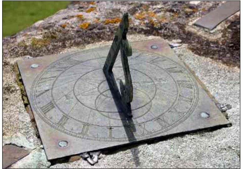
Fig. 9. The clearly engraved but anonymous dial, quite deliberately fixed to the stone balustrade.

One may speculate as to how the line was laid out and then to be in error, especially having gone to the trouble of creating a good aperture and the rather permanent extreme of bricking up a window. It is quite likely that the error was found soon after construction, and the distorting glass window was left in place when it could have been easily removed, although this would not have corrected the fundamental error.