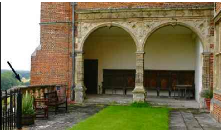
Fig. 8. The horizontal dial (indicated by the arrow) is situated near to the meridian line in the loggia and outside the main hall. The buttress to the wall will cut off the afternoon sun after about 1.30 to 2pm, depending on the season.

A follow-up visit was carried out to draw a plan of the loggia and measure the angle of the line relative to the south-east – north-west wall (at right angles to the direction of the building as whole). The angle is 31.6^\circ . The easiest way of determining the declination of the longest dimension of the building without on-site determination is to use a modern Google Earth aerial or satellite photograph with the overlay of the latitude and longitude. This angle is about 34^\circ west of south and confirms that the line is seriously in error by some 2.4^\circ , which is consistent with the observed error in time.