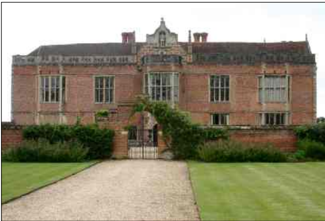
Fig. 1. Bramshill House: the north east side with the figure of Sir Edward Zouche high in the niche.

Summary. This article describes what may be the first meridian line in the British Isles, dating from around 1720. It is in a loggia in a fine Jacobean mansion, together with a very early west declining dial and a horizontal dial. In addition, there are photographic records of two other dials.