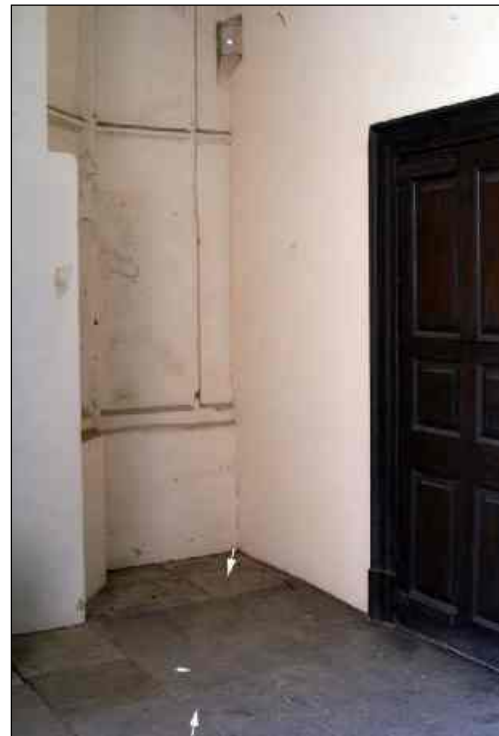
Fig. 4. The aperture, about 20mm in diameter, and a spot of sunlight having crossed the line at solar noon, taken on 3 August 2007.