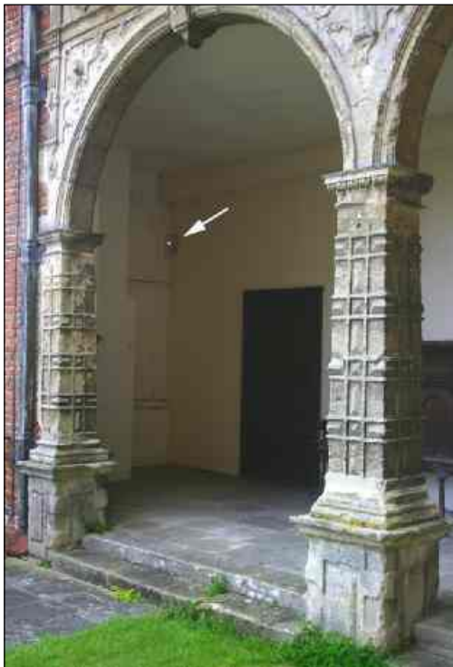
Fig. 3. The loggia, looking towards the aperture (just visible). The line runs from the corner below the aperture across the stone floor to the base of the pillar on the right of the photograph.