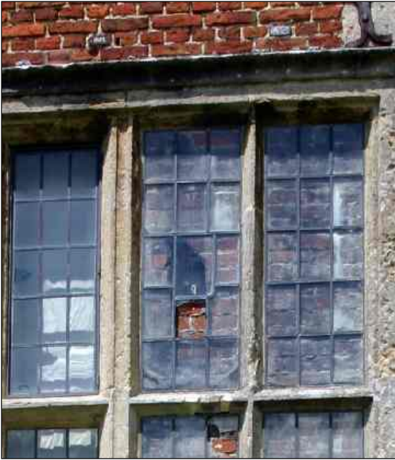
Fig. 7. Close up view of the window with the crude opening in the brickwork and slightly larger glass pane. The missing pane of glass just below, judging from very early photographs, has been missing for some time.

the floor line extending up the pillar, which it would do so by just over a metre.