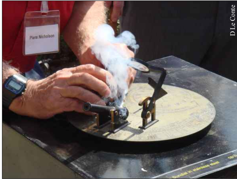
D Le Comte

Nowadays, one is not allowed to buy 'black powder' (gunpowder) unless one has obtained a special licence for it, but there is a black powder substitute called Pyrobex,